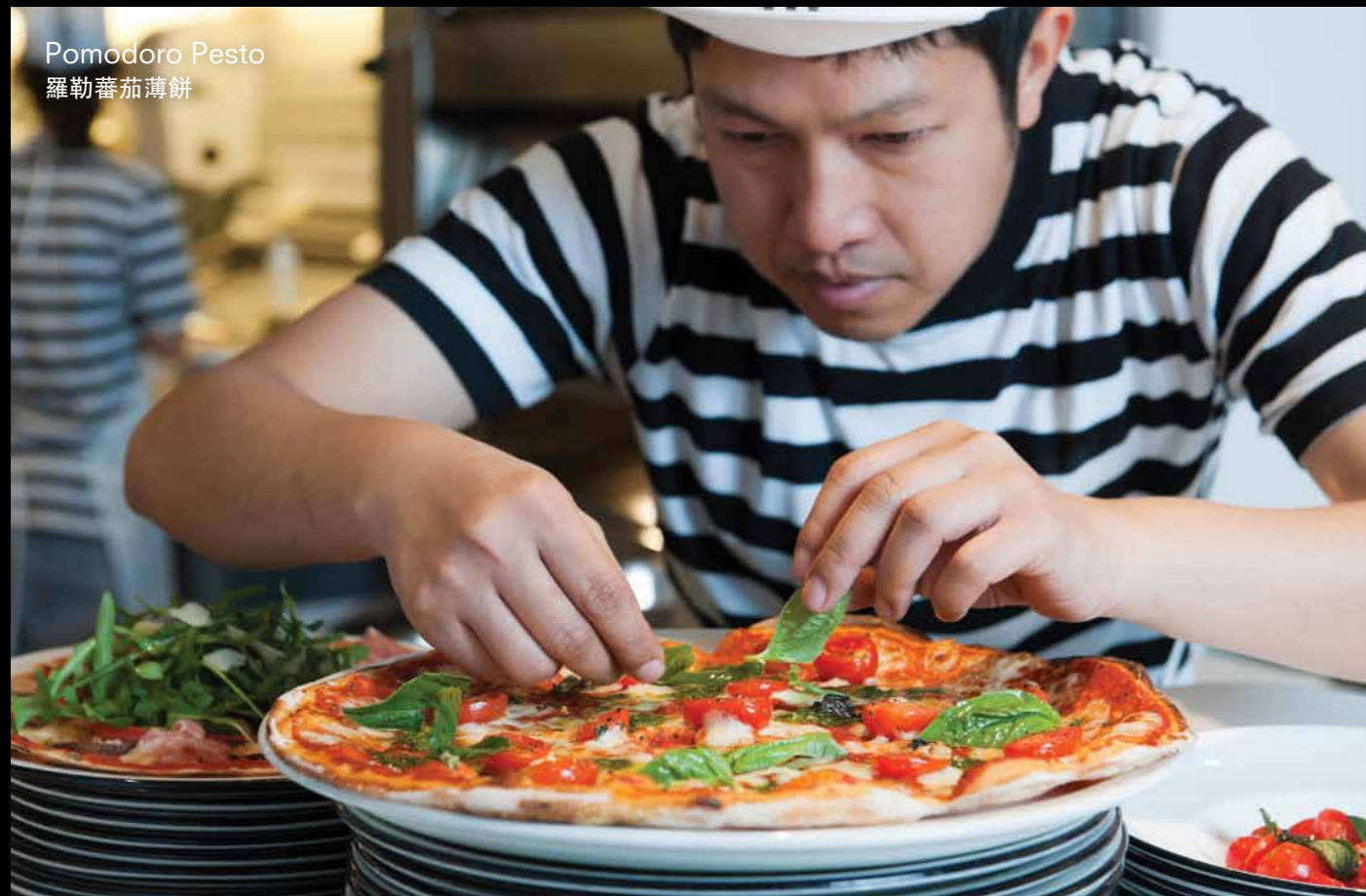
Pomodoro Pesto 羅勒蕃茄薄餅