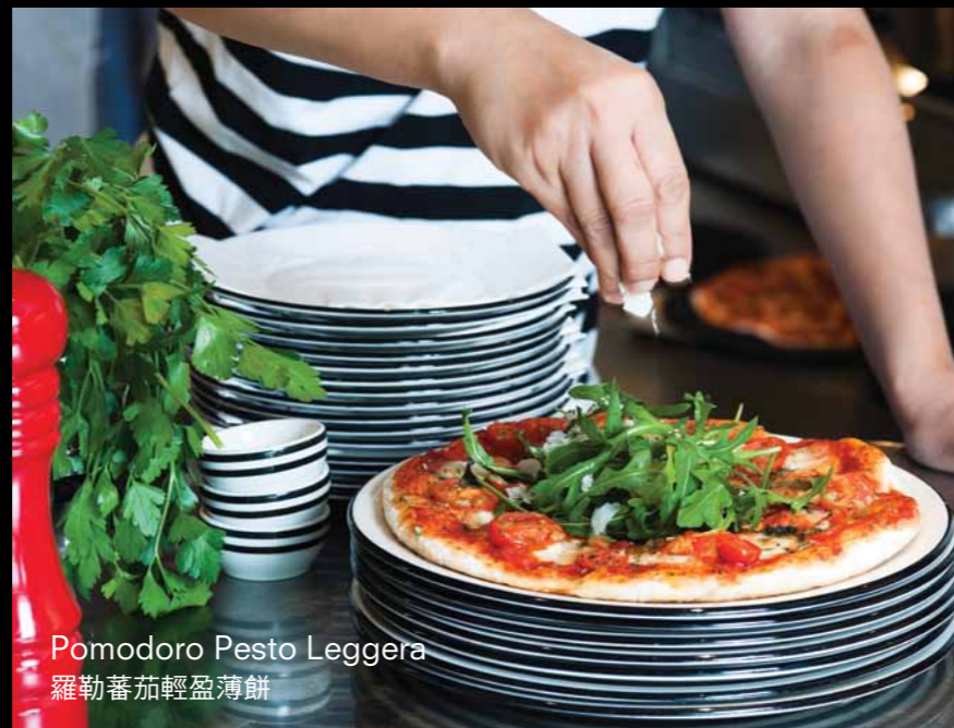
Pomodoro Pesto Leggera 羅勒蕃茄輕盈薄餅