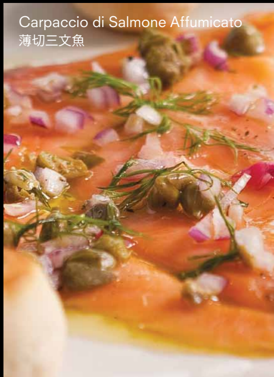
Carpaccio di Salmone Affumicato 薄切三文魚