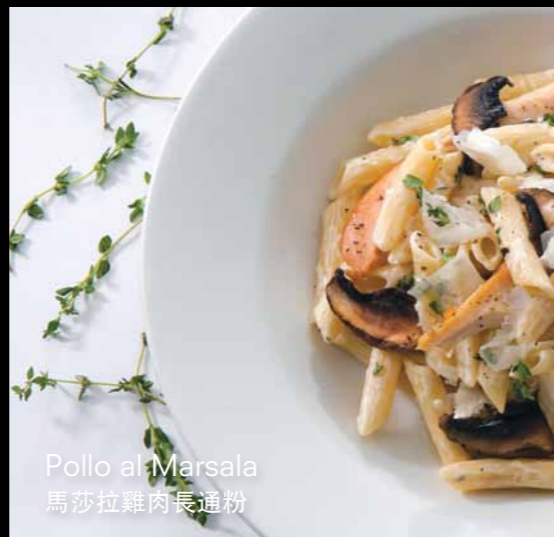
Pollo al Marsala 馬莎拉雞肉長通粉