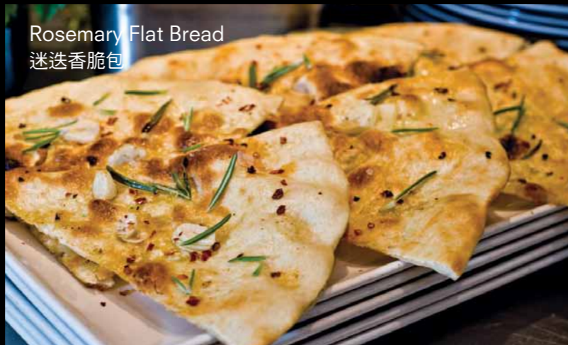
Rosemary Flat Bread 迷迭香脆包