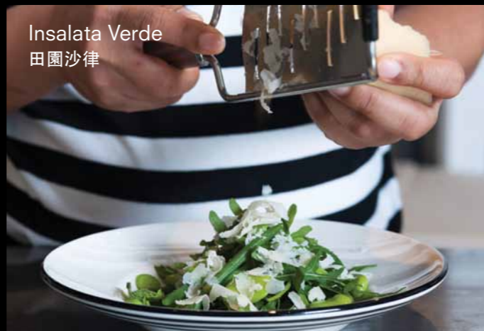
Insalata Verde 田園沙律