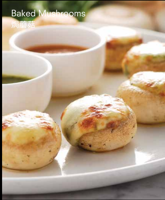
Baked Mushrooms 焗蘑菇