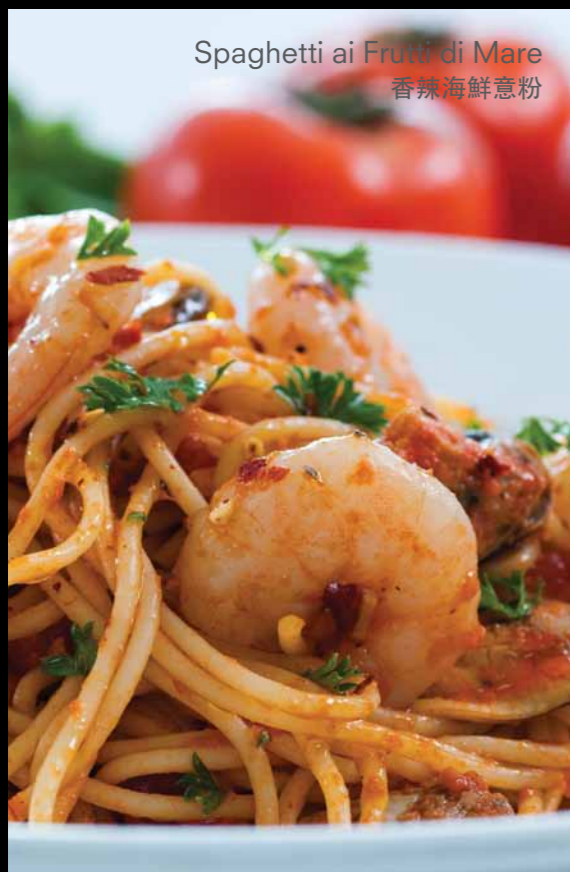
Spaghetti ai Frutti di Mare 香辣海鮮意粉