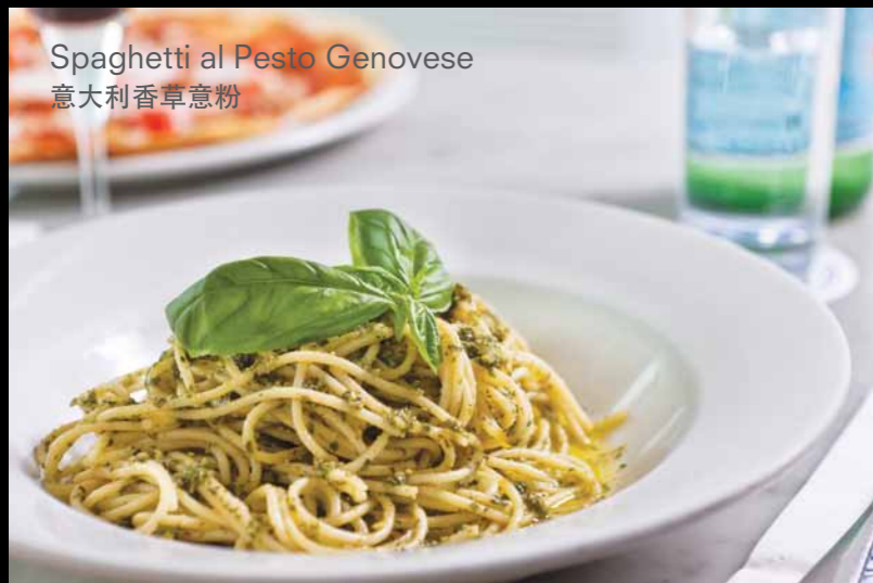
Spaghetti al Pesto Genovese 意大利香草意粉