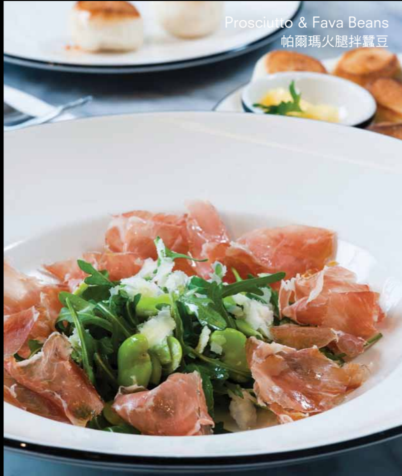
Prosciutto & Fava Beans 帕爾瑪火腿拌蠶豆