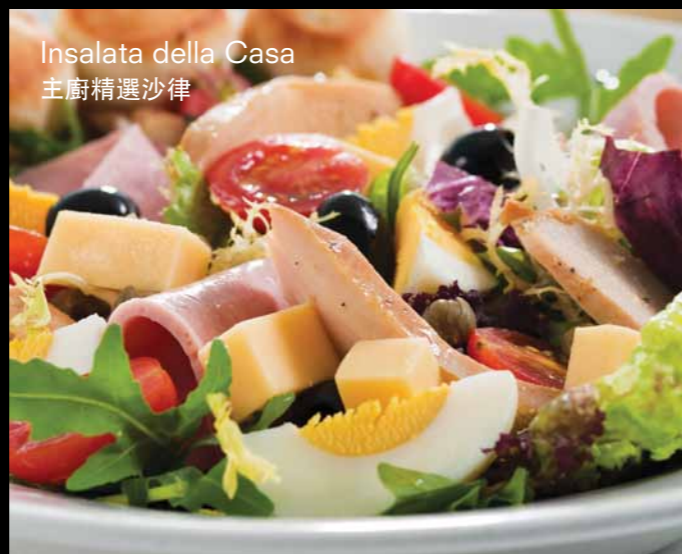
Insalata della Casa 主廚精選沙律